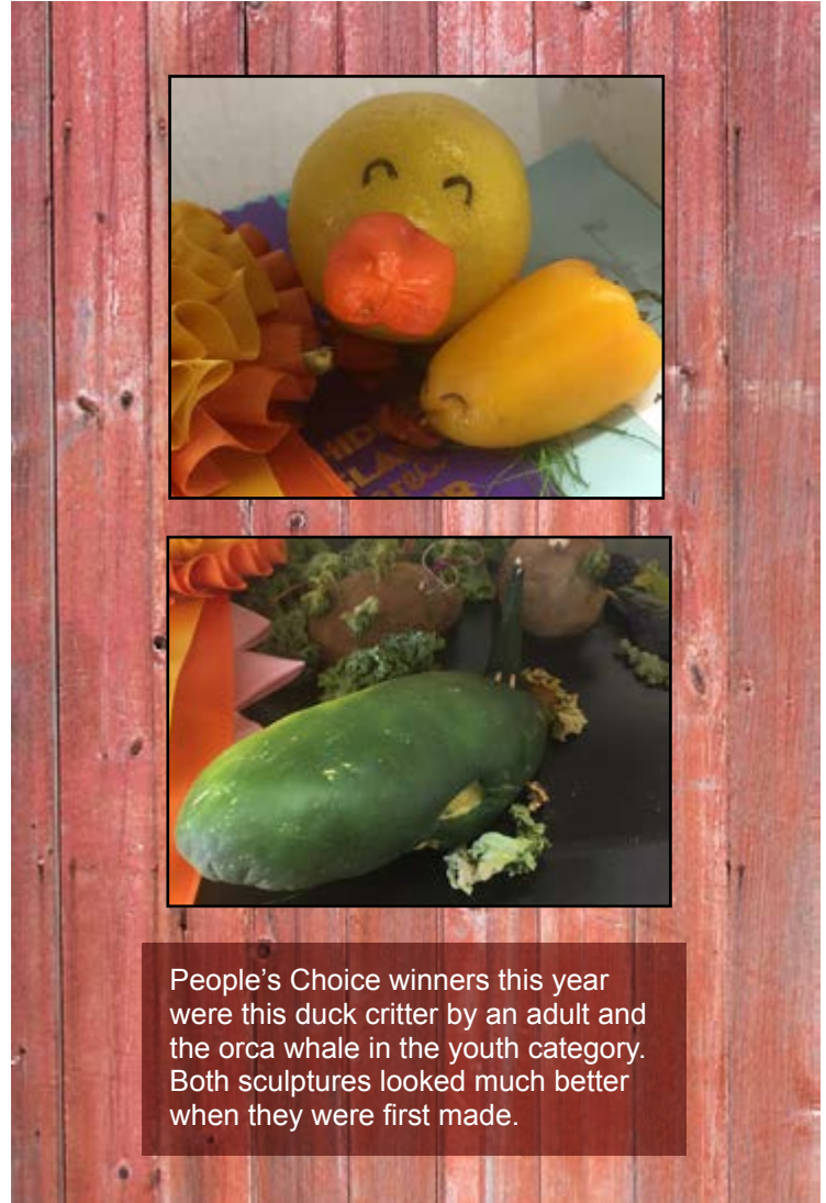
People’s Choice winners this year were this duck critter by an adult and the orca whale in the youth category. Both sculptures looked much better when they were first made.