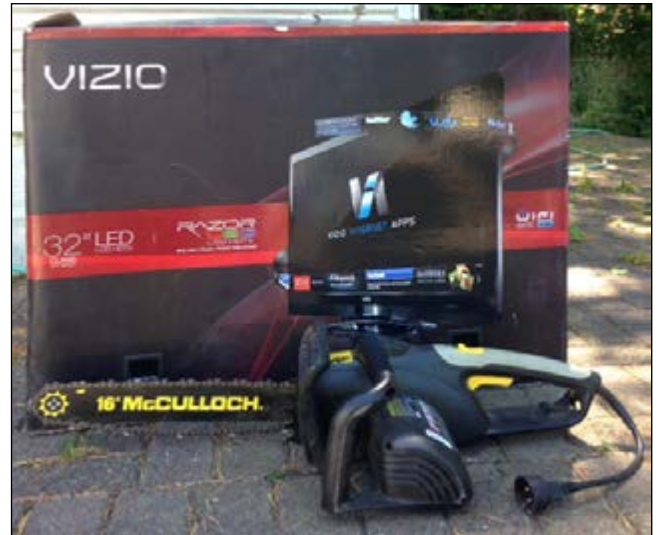
Pictured is the flat screen television and the electric chain saw.