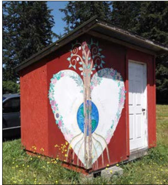
The first mural, Global Heart/Treasure Our Island, was done in 2004. The Tree of Life mural will extend to other market buildings.

The main mural will extend from the structure it is painted